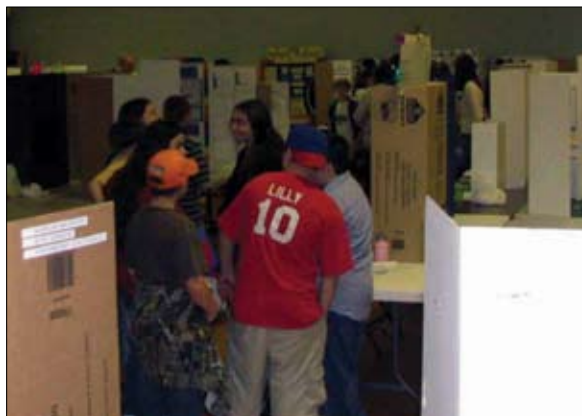
Students, grades six-12, prepare their exhibits and wait for judging at the 2007 North Central West Virginia Science, Energy and Engineering Fair at FSU.

The 2007 North Central West Virginia Science, Energy and Engineering Fair, was held