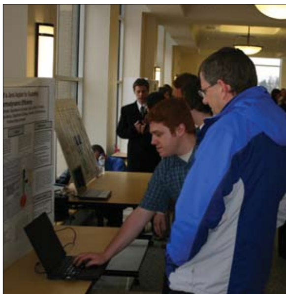
Students and faculty were honored at the first annual Celebration of Student Scholarship; an event used to showcase the research of FSU students and recognize the guidance of faculty mentors.

The first annual Celebration of Student Scholarship, held on April 18, 2007, showcased the creative work and exceptional research of FSU students and recognized the guidance of faculty mentors who helped students achieve their academic goals.