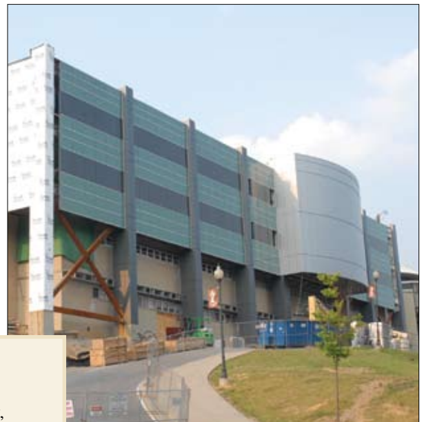
August 2007 photo of the new Engineering Technology Wing of Wallman Hall, as viewed from Locust Avenue.

Architecture will be staying in the Turley Center, and all other College of Science and Technology programs will remain in their existing locations.